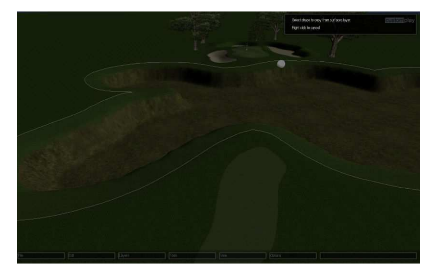
Now highlight the outer border shape (left click)