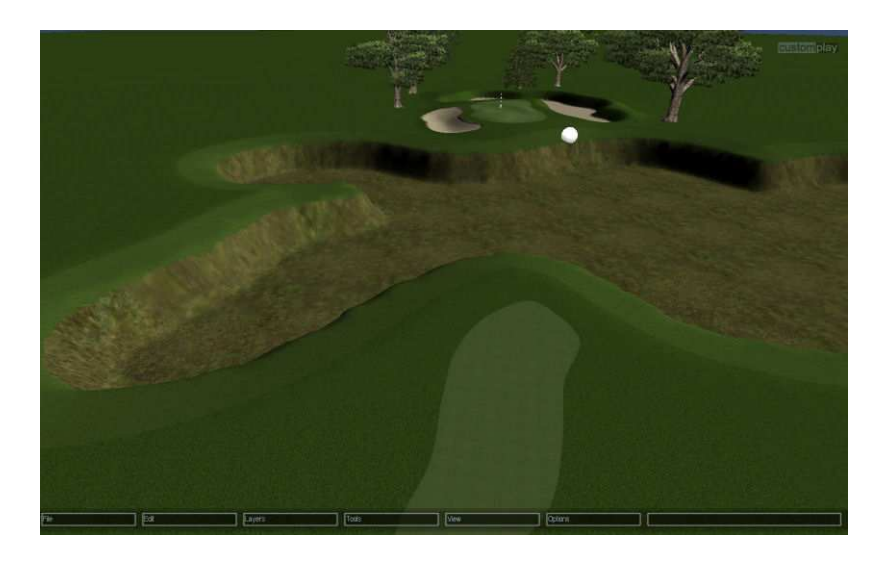
Hey that looks kind of natural that way, nice job! (Ego Trip)