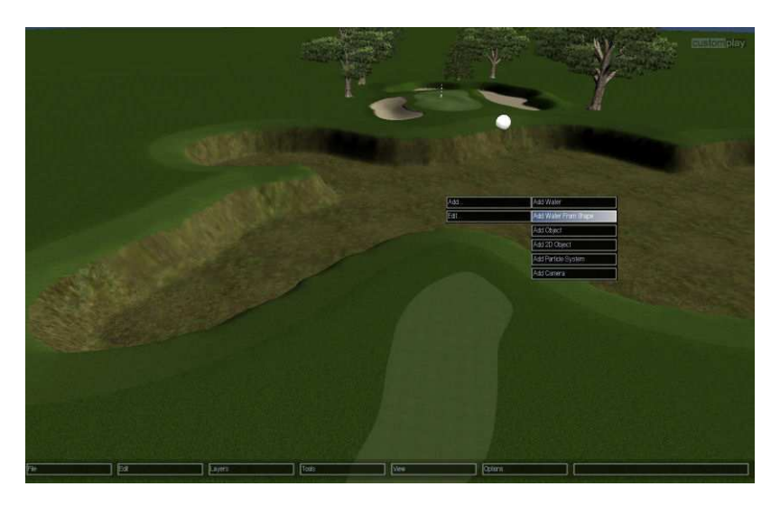
Let's add our water now, right click on the screen and select "Add/Add Water from Shape".